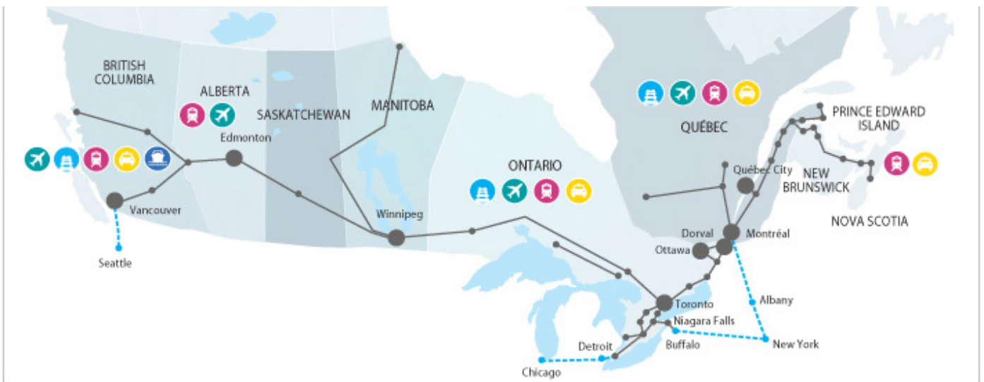
VIA Rail Amtrak Airport shuttle / Airline partners Commuter trains and buses / Taxis Ferry Car-sharing service

In 2012, 9,275 passengers booked their train trip on www.viarail.ca to Montreal Trudeau Airport (YUL) and used VIA's free AirConnect shuttle from the Dorval Rail Station to the airport to catch their flight. 7,965 passengers booked their train trip on www.viarail.ca to Toronto Pearson Airport (YYZ) and connected with Airport Express (operated by Pacific Western Transportation) from the Toronto Union station in downtown to the airport to catch their flight.